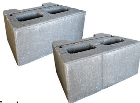
CleanCut Square Foot Unit 2 8" H x 18" W X 12" Deep