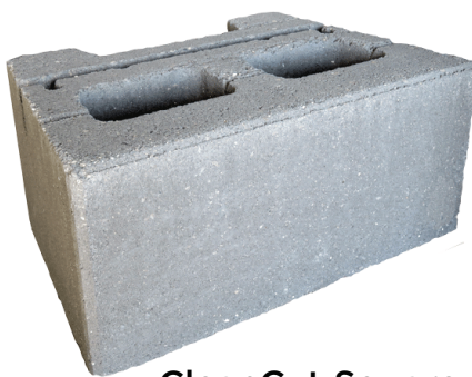
CleanCut Square Foot Unit 1 8" H x 18" W X 12" Deep

VERSA-LOK CleanCut units features pinned offsets to create dimensional wall faces and can be used with contrasting colors or textures to create new design options for random-pattern walls.